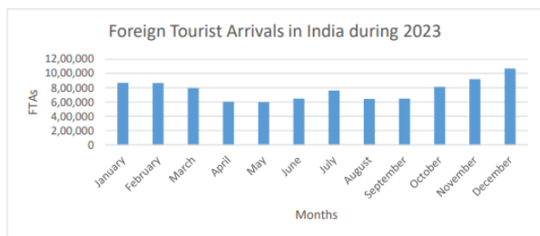
Fig. 1: Foreign Tourist arrivals in India during 2023 2)

both operational efficiency and the quality of the visitor experience is technology. Due to technology adoption increases economic efficiency 5) . Prior research has been dedicated to Innovation and technology adoption but little has been done on the impact on Performance of Hotel. Innovation is very crucial to be more competitive in market. Innovation has a good effect on the economy, but how it affects the performance of hospitality organizations is unclear, and there have been few studies that attempt to explain innovation behavior in this industry 6) . Organizational success is achieved when product quality is enhanced, efficiency is increased, expenses are reduced, demands of consumers are met, and sales and profits are increased. Previous literature on innovation is lacking in depth since the topic of innovation performance analysis has received insufficient attention, with a focus on the financial and employee outcomes of this industry 3;4) . India likewise suffers from an absence of in-depth analysis.