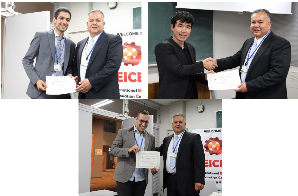
The winners receive their certificates from the chairman. Afternoon of Oct. 20