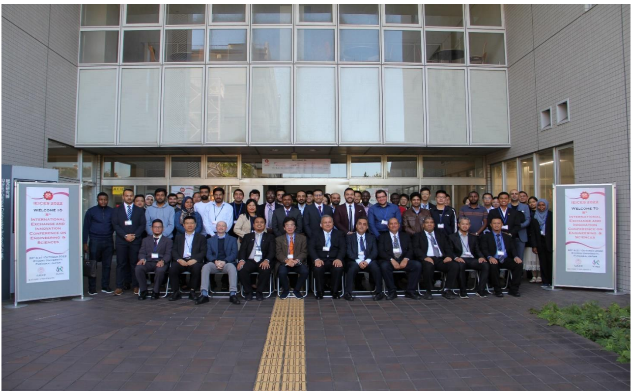
IEICES 2022 Group Photo