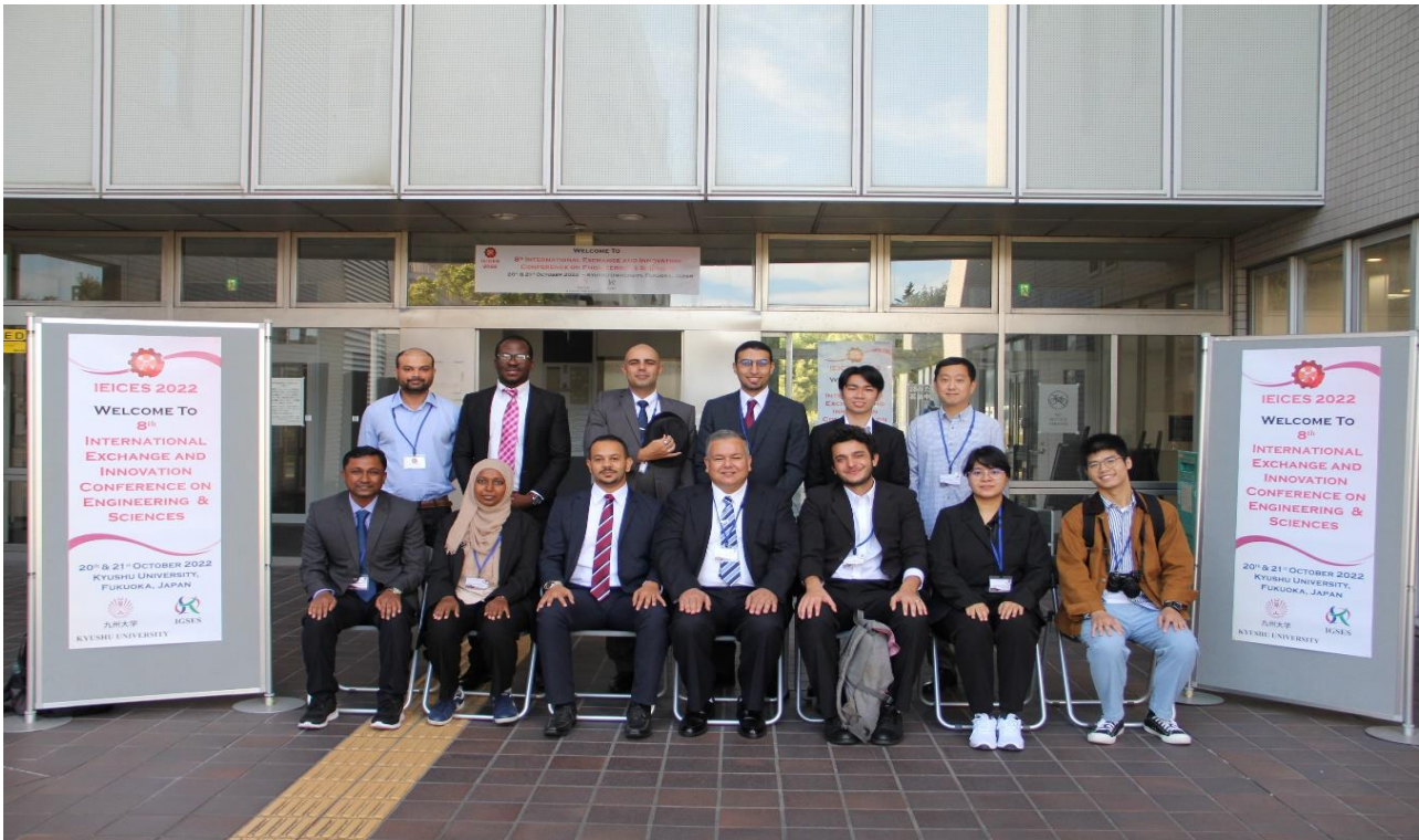
IEICES 2022 Organizing Committee