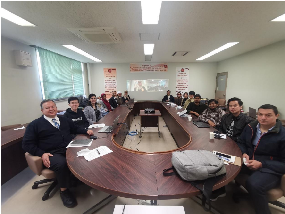
IEICES 2021 Organizing Committee