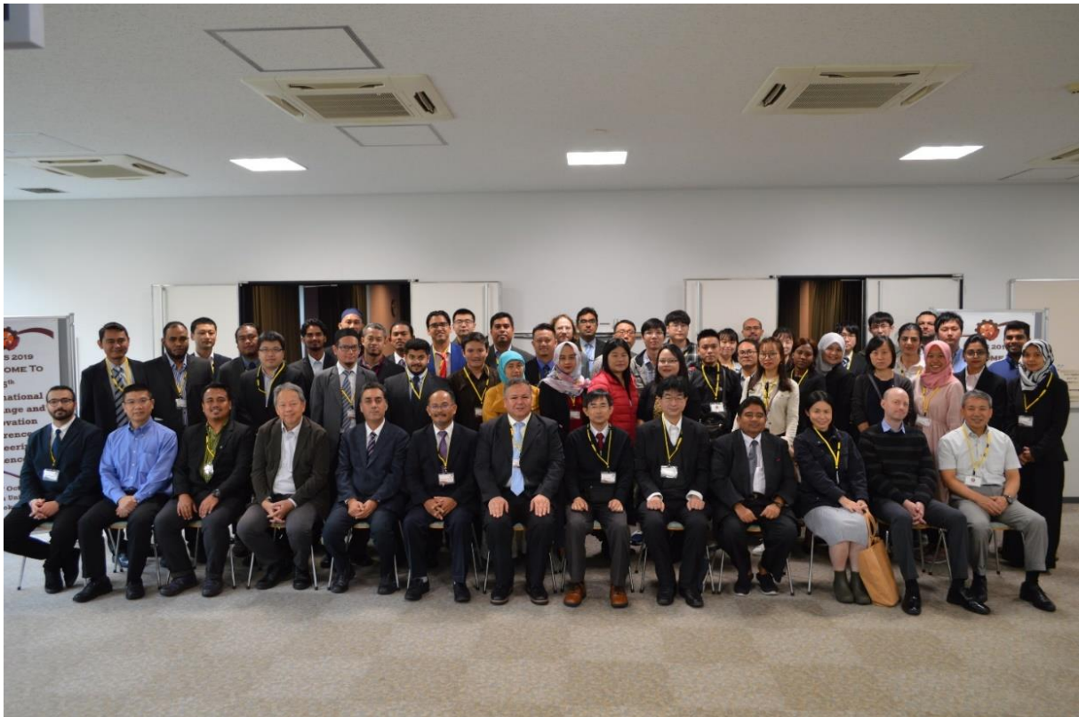
IEICES 2019 Group Photo