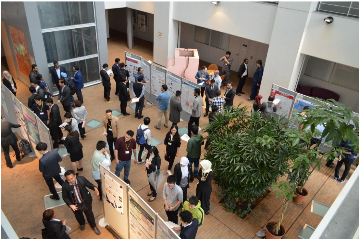
IEICES 2019 Poster Session