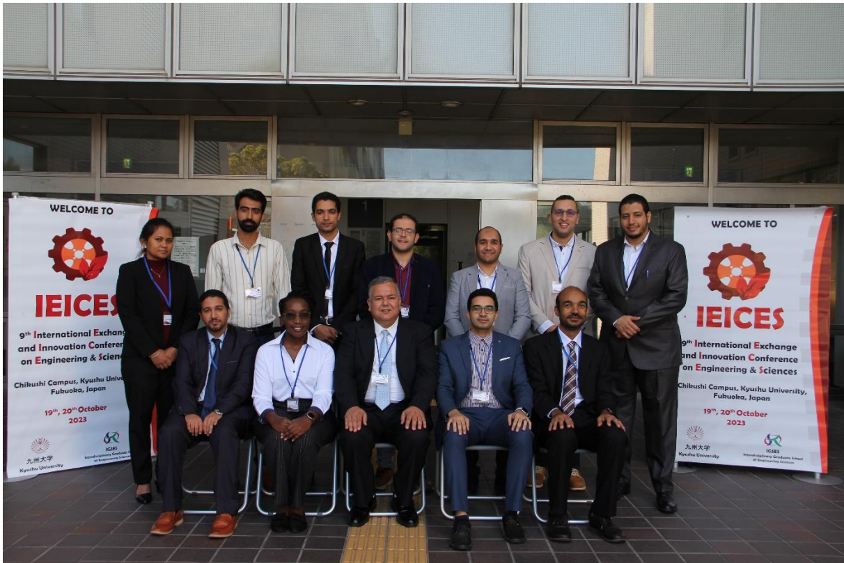
IEICES 2023 Organizing Committee