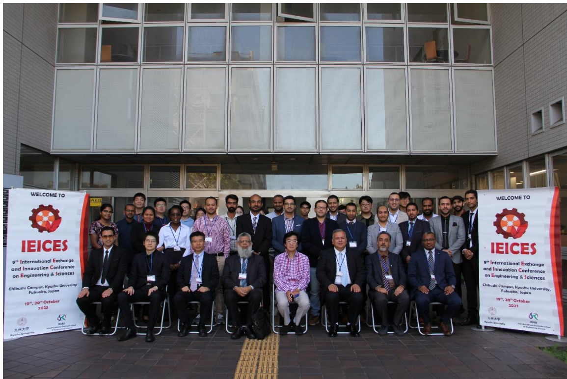
Group photo of physical participants. Morning of Oct. 19