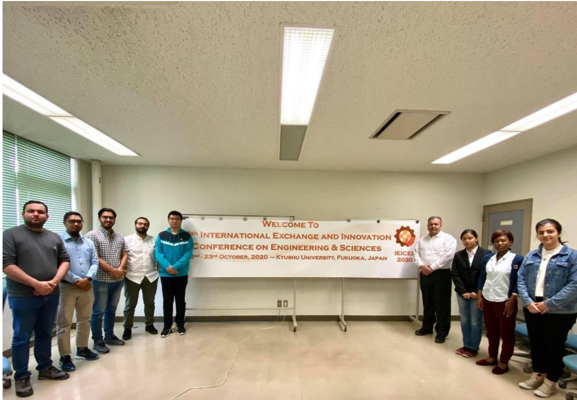
IEICES 2020 Organizing Committee