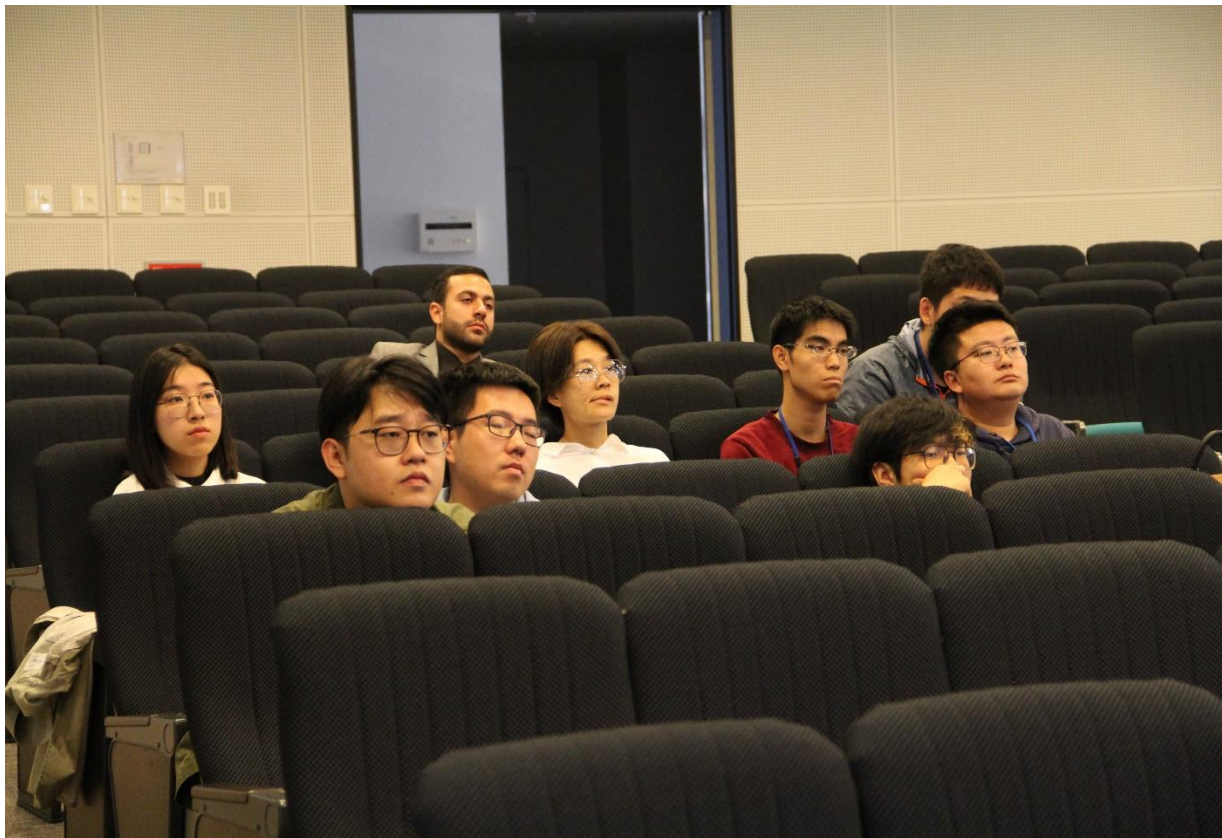
Conference venue, Chikushi Hall, Midday of Oct. 19