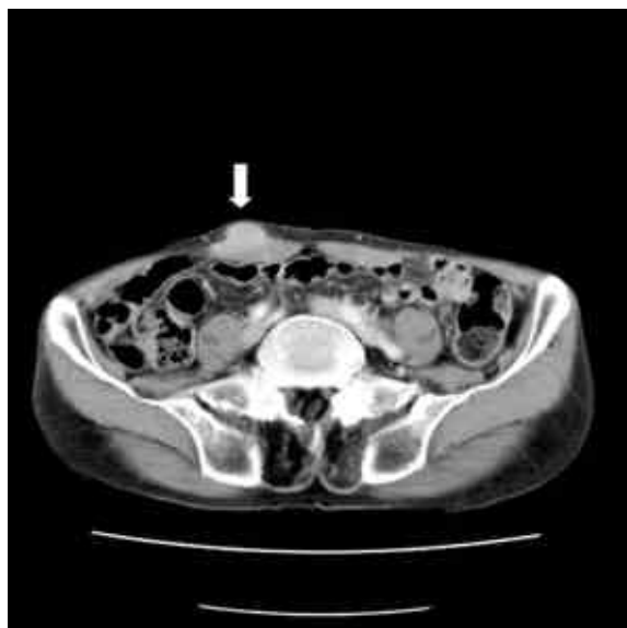
Fig. 2 Computed tomography showing a subcutaneous, relatively high density mass (white arrow) due to the administration of leuporelin acetate 11.25 mg, mimicking a metastatic nodule.