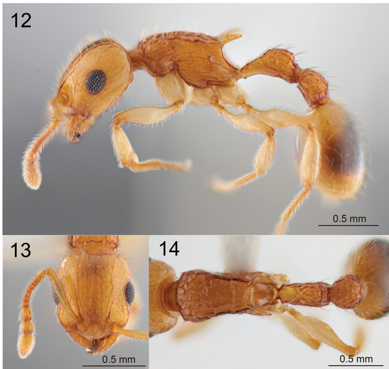
Figures 12–14. Rotastruma epispina sp. nov., holotype worker (KUEC) from Cambodia (HW 0.62; WL 0.84). 12 , Body in profile view; 13 , Full-face view of head; 14 , Dorsal view of body.

with 11–13 ommatidia. Frontal carina irregularly extending to posterior margin of head. Mandible with 6 teeth; two apical teeth large. Antenna 12-segmented, with 3-segmented club; scape not reaching posterolateral corner of head.