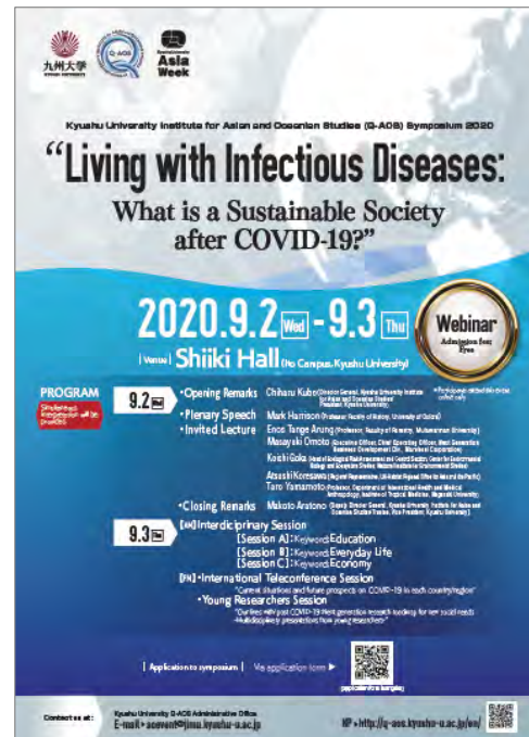
The second symposium was organized by Kyushu University Institute for Asian & Oceanian Studies (Q-AOS).