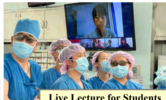
Live Lecture for Students