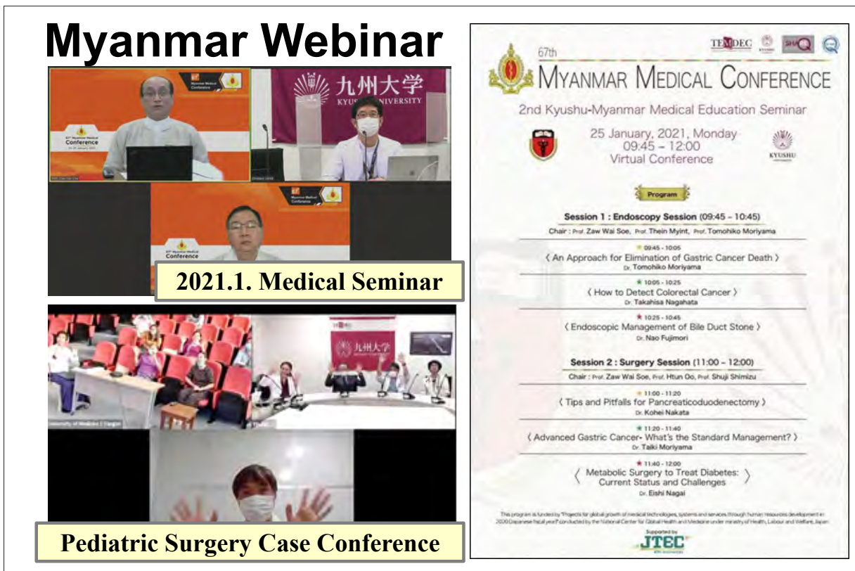
All the activities in Myanmar project were also done remotely as shown here.