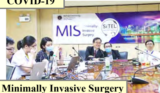
Minimally Invasive Surgery