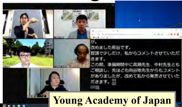
Young Academy of Japan