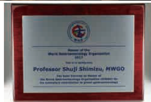
Figure 2-5 Our activity won “Master of the WGO” Award in October, 2017.