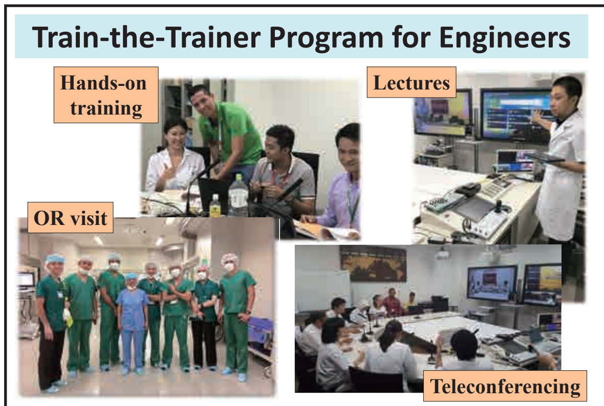
Figure 2-7 Many engineers were trained for a month in Kyushu University Hospital.