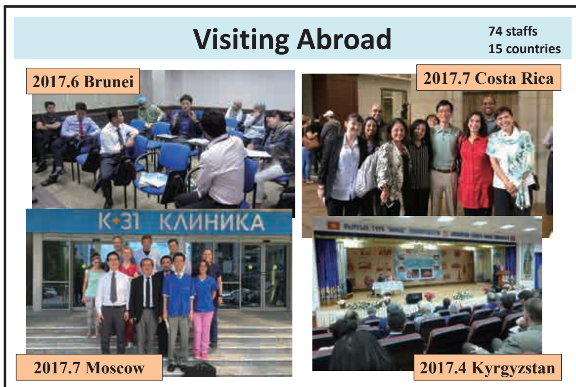
Figure 2-9 Visiting foreign universities and hospitals went worldwide.