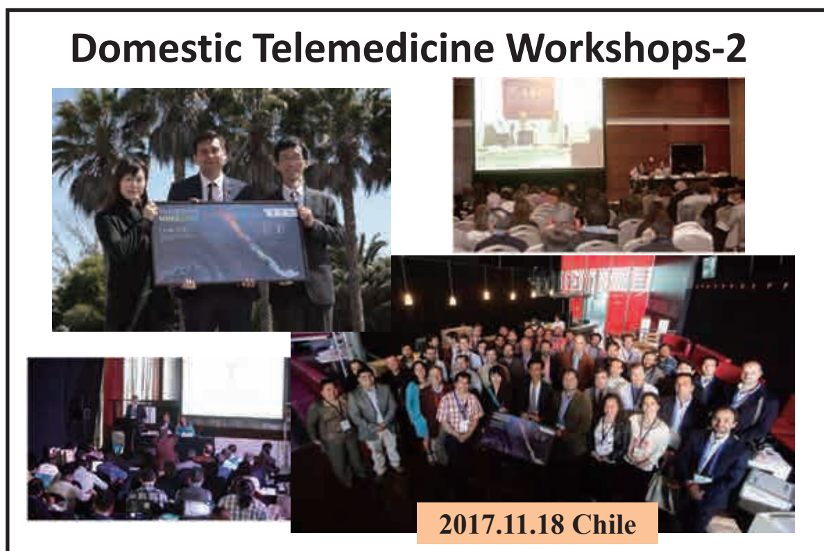
Figure 2-4 The first telemedicine workshop in Chile, which is the first in Latin America.