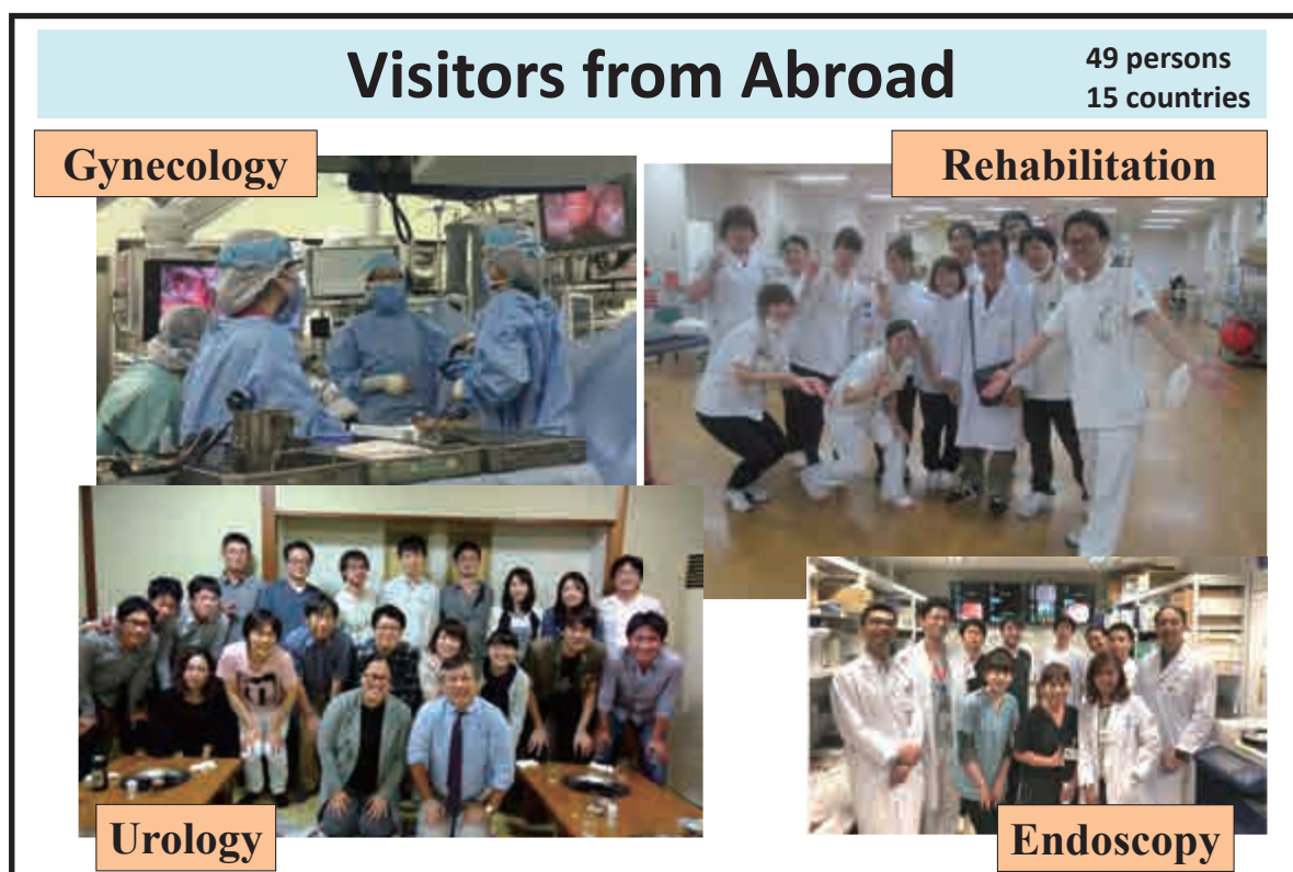
Figure 2-8 Short-term training for doctors expanded to variety of departments.