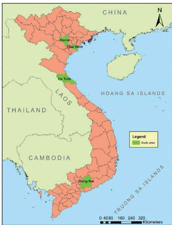
Fig. 1. Locations of Ha Noi, Thai Binh, Ha Tinh and Dong Nai

The study applied the SPSS 22 to process the data. We used crosstab computation and other descriptive methods to provide the general descriptions of swine farms, water use and wastewater reuse situation. The wastewater quality was assessed by the QCVN62: 2016/ BTNMT– Vietnam National technical regulation on the effluent of livestock, and the Draft of Vietnam National technical regulation on livestock wastewater for irrigation.