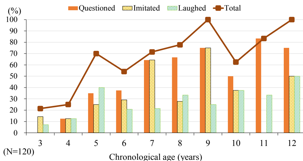
Figure 1: The proportion of CWS who had been questioned about their speech patterns, imitated, or laughed at by others.

ten questioned and laughed at. The aim of this study was to interview CWS aged 3-12 years on their experiences of being questioned, imitated, or laughed at, and to determine whether these incidents left them feeling unhappy.