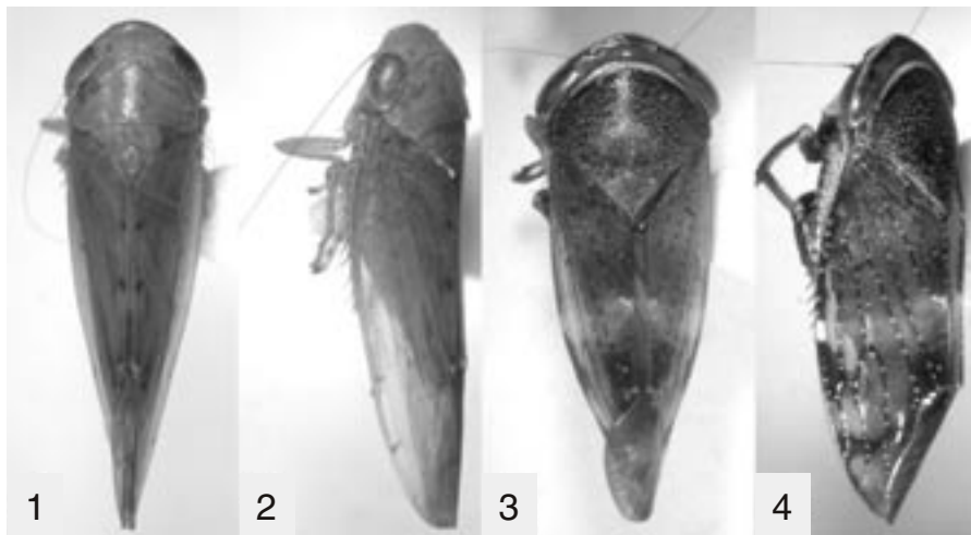
Figs. 1-4. Indonesian Selenocephalinae. 1-2, Parohinka kendengensis sp. n.; 3-4, Drabescus yoshitakei sp. n.

triangular. Subgenital plate slender, triangular, apical region digitate and weakly sclerotized; ventral surface with several short setae on outer margin and apical region. Style robust; apical process short, strongly pointed apically, directing outside. Connective Y-shaped, articulated with aedeagus; arms short, and expanded laterally. Aedeagus asymmetrical, flattened, with one process on right side and two processes on left side; each process directed anterolaterally; aedeagal shaft almost straight, similar width throughout length in lateral view, rounded apically; basal apodeme stout and slightly compressed anteroposteriorly; gonopore situated at subapex near the apical left process.