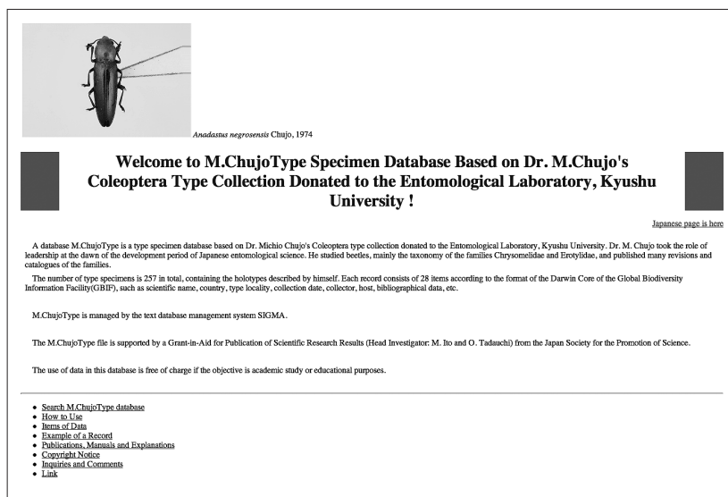
Fig. 2. A home page of a specimen database file M.ChujoType in the AIC in English version.