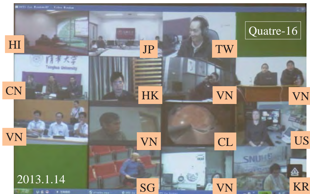
Quatre-16 demonstrated the connection of 14 sites with DVTS, proved to be another technical breakthrough.