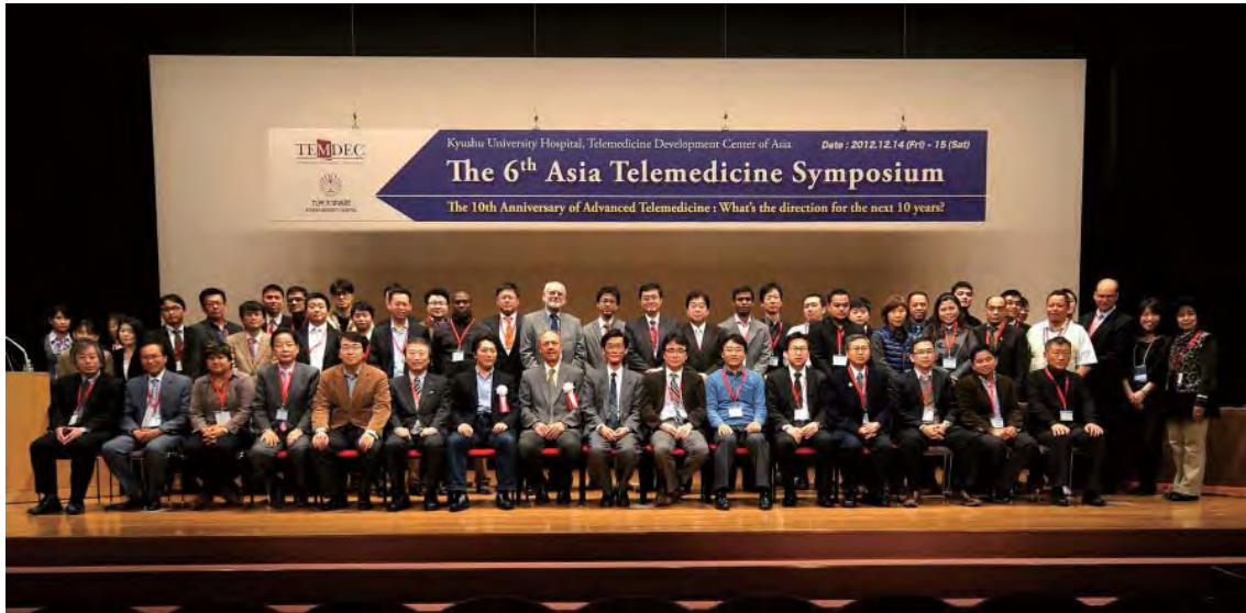
The 6 th Asia Telemedicine Symposium was held, commemorating the anniversary.