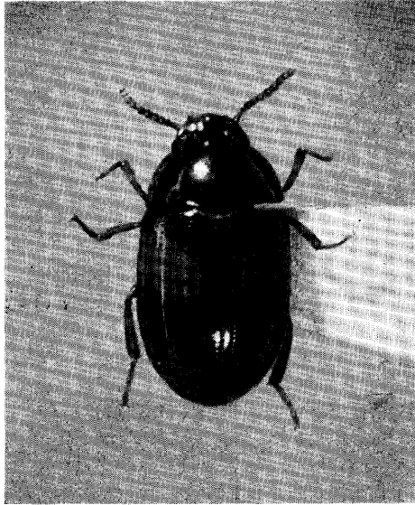
Fig. 1. Platydemus planicornis sp. nov.

Elytra finely and sparsely punctate, strongly punctate-striate, interstices very feebly convex; basal maculae slightly oblique, extending from 2nd to 8th interstices, apical maculae cover up nearly 1/3 of elytra except for median line; basal margin shallowly sinuate at middle 1/3, side margin narrowly marginate.