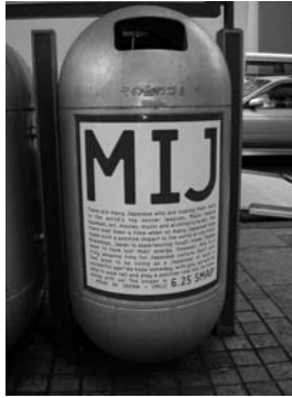
Figure 3: MIJ Harajuku 5/18/03