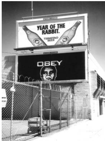
Figure 6: Fairey's Obey Giant

While the image itself may have no inherent meaning, it is the placement of these stickers that drives Fairey's politics. He writes: "Because people are not used to seeing advertisements or propaganda for which their product or motive is not obvious, frequent and novel encounters with the sticker provoke thought and possible frustration, nevertheless revitalizing the viewer's perception and attention to detail" (Fairey 2002: 4). In other words, for Fairey, context is crucial. He claims that his works must be installed in public spaces in ways that compete with other forms of signage and corporate advertising (Figure 6). "The fact that the images are placed in public without permission," writes Fairey (2002: 4), "brings the control of the public space into question." Thus, by integrating his art into the fabric of urban landscapes, Fairey forces viewers to become "curious about the images and how they relate to their surroundings, therefore bringing the surroundings into question as well" ( ibid. ).