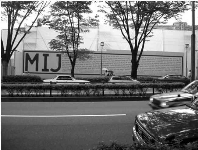
Figure 1: MIJ Omotesandō 18/05/03

anese home run king in the Majors. On the movie front, a Japanese won the Oscar for the best animated feature film. One of the world's top fashion brands has worked in a tie up with a Japanese artist. In classical music, we have the Japanese conductor who has won world wide praise. This was the first time that Nobel prizes were won by Japanese in two separate fields in one year. Has there been any other period where so many Japanese have played such active roles in the world at one time? Nowadays, Japan is experiencing tough times. People seem to have lost their energy. However, this is a truly amazing time for Japanese culture. Don't you feel good to be living as a Japanese insuch [sic] a wonderful age? We should be encouraged by their achievements and feel a little proud of ourselves. We hope that someday, with you, we will be able to walk tall and play a positive role too. So come along with us! The slogan is—MADE IN JAPAN = [MIJ]