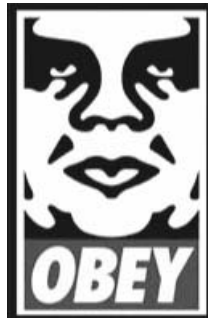
Figure 5: Fairey's "Obey the Giant"

The OBEY GIANT project began 1989 with the creation of Fairey's first sticker modeled upon the face of American wrestling star, Andre the Giant (Figure 5).