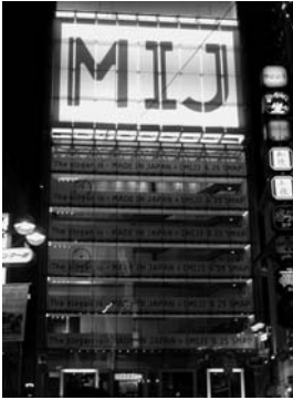
Figure 2: MIJ Shibuya 5/24/03