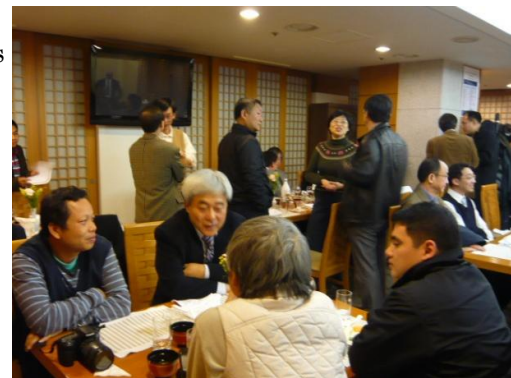
The discussions continued at the after-party