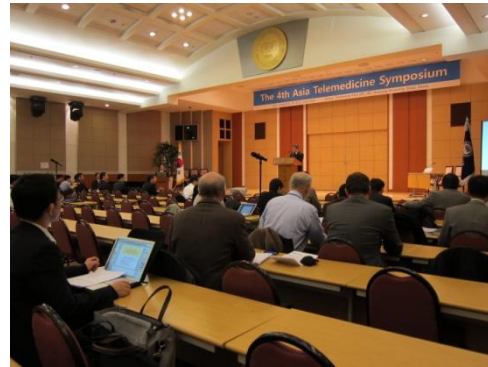
An active discussion

After the symposium, a dinner was held. Participants from each country gathered together to continue the discussions, even outside the formal symposium. The main topic for the symposium was teleconferencing, and through events like this, we can appreciate how teleconferencing facilitates the expansion of our activities and leads to face-to-face communication.