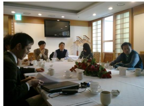
Medical Working Group