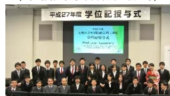
〈2016/2/27 Graduation at PNU〉