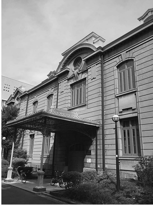
Figure 2. Exhibition Hall, Faculty of Letters, Kyoto University: Former building of the Department of Archaeology

Kyoto Imperial University (Suenaga et al. 1943).