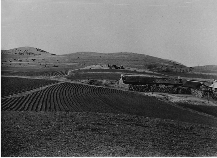
Figure 5. Excavation at Shangmashi Shell Mound, Liaodong Peninsula, conducted in 1941 by Japanese archaeologists