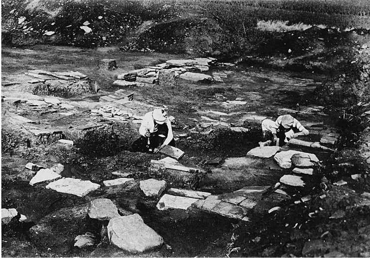
Figure 4. Excavation at the Site of the Lelang Provincial Office in Korea, conducted by Prof. Yoshito HARADA, Tokyo Imperial University

excavations at these sites were followed by an excavation at Hongshan Site, Chifeng, in Eastern Inner Mongolia, in 1936. The Hongshan Site had a Neolithic settlement and a cemetery dating to the Bronze Age. These excavations at Hongshan Site led to the designation of Hongshan culture, a type of Neolithic culture, in Manchuria, after the establishment of the Republic of China. They published Numerous voluminous excavation reports were published soon after these excavations (Hamada & Mizuno 1938). On the other hand, during 1941 to 1942, the Japan Society for the Promotion of Science conducted excavations at three prehistoric sites: Shangmashi Shell Mounds (Figure 5), Sipingshan Cairns (Figure 6), and Wenjiatun Shell Mounds in Liaodong Peninsula. These were conducted by Professor Sueji UMEHARA of Kyoto Imperial University and other Japanese scholars. Unfortunately, however, they did not report the outcomes of those excavations at that time. It is only recently that the reports were finally published by Japanese archaeologists (Okamura ed. 2002, Sumita, Onoyama, Miyamoto ed. 2008, Miyamoto ed. 2015).