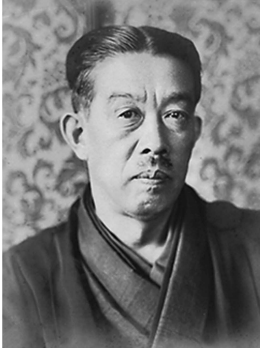
Figure 3. Kousaku HAMADA: The first professor of the Department of Archaeology at Kyoto Imperial University