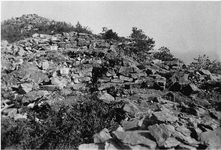
Figure 6. Excavation at Sipingshan Cairn, Liaodong Peninsula, conducted in 1941 by Japanese archaeologists

of the Kojiki and Nihon Shoki , which were compiled in the 8 th century. His views expressing doubts over the legends forced him to resign as professor at Tokyo Imperial University due to the relationship between the centrism of the legends and imperial