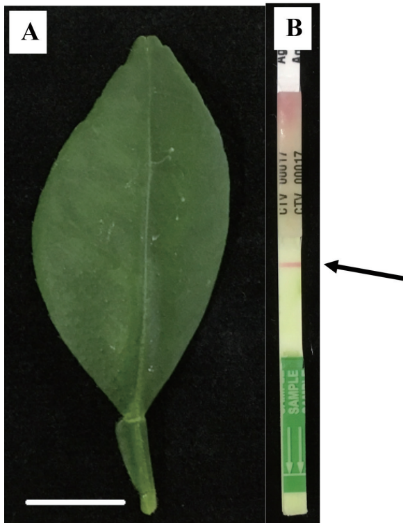
Fig. 2. Elimination of CTV in triploid pummelo 112A 4–6 months after in vivo micrografting. (A) A leaf of CTV-free triploid pummelo 112A 4–6 months after in vivo micrografting; (B) immunochromatographic assay of the CTV-free shoot of 112A. An arrow indicates a control line for CTV. There is not visible test line. Horizontal white bar=5 mm.

The rates for successful micrografting ranged from 4.4% to 16.0% for shoot tips with two leaf primordia,