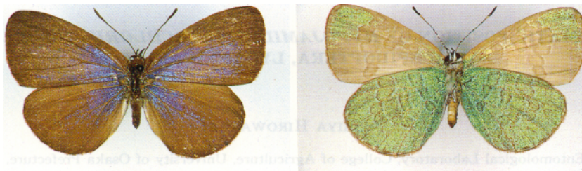
Fig. 1. Nacaduba catochloris (Boisduval) comb. nov. A : Female, upperside. B : Ditto , underside.