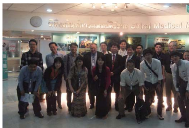
The hospital tour group at Siriraj Medical Museum