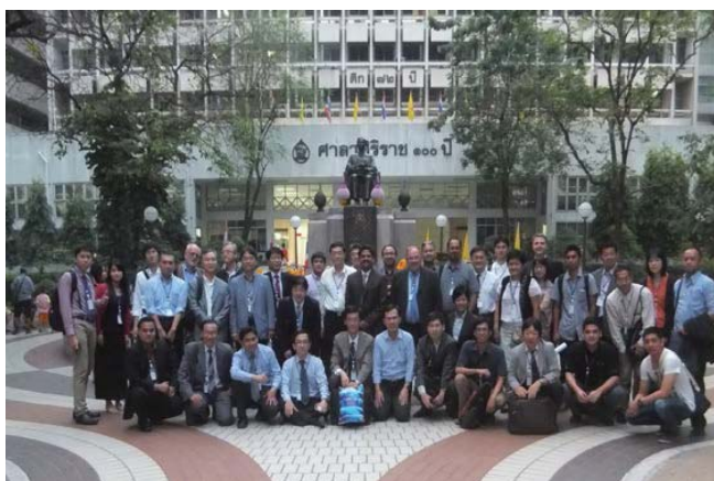
The assembled participants