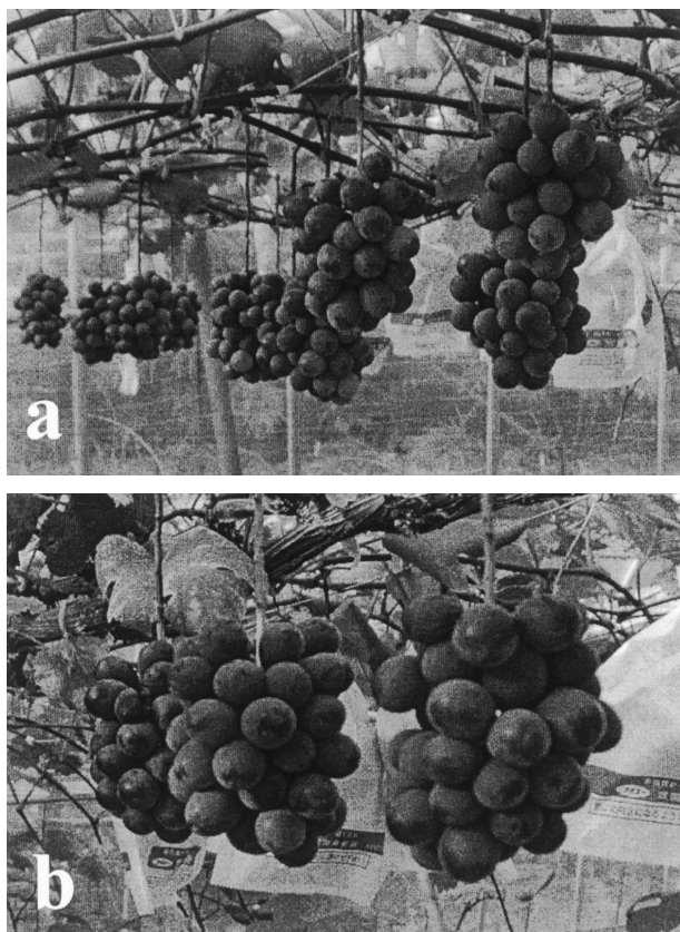
Fig. 3. Fruits of 'Bea-Kei' grape cultivar at the end of August just before full ripening.

a: Clusters were treated with 100 ppm GA 3 solution at full bloom. b: Typical example of 400 g clusters with about 40 berries each.